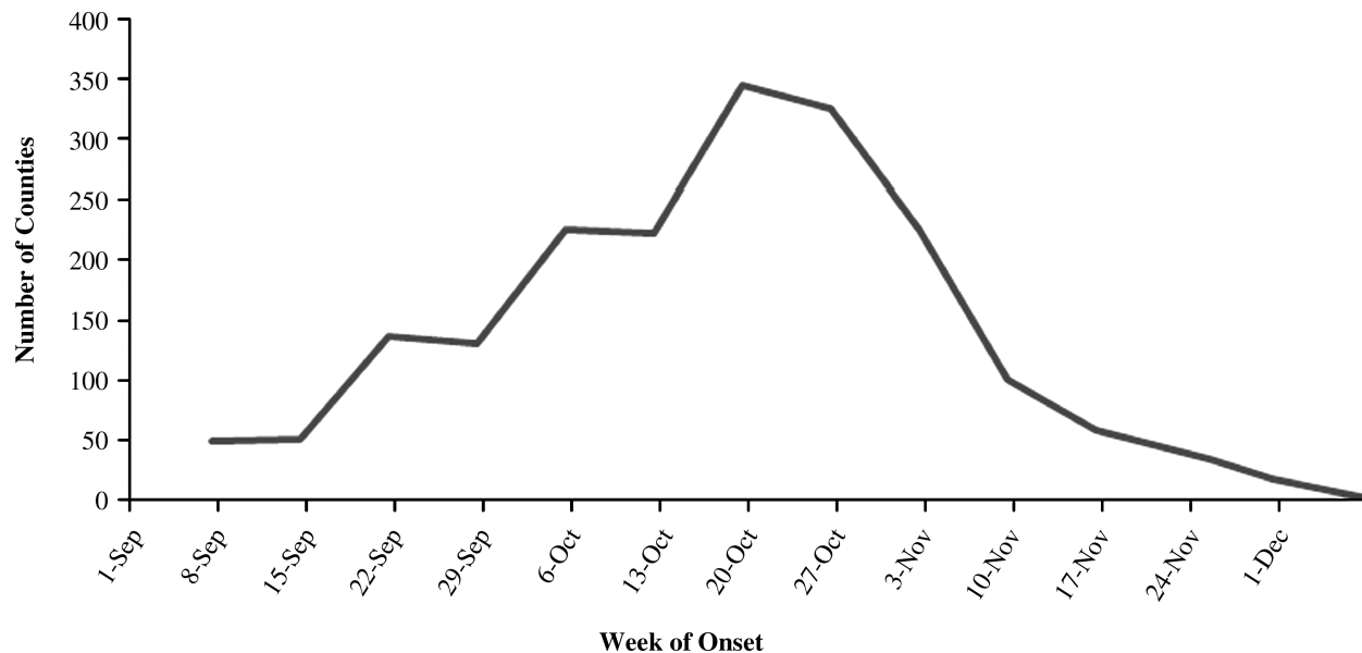
Figure 1. Number of Counties Reporting New Influenza Outbreaks by Week of Onset, United States, September-December 1957 a