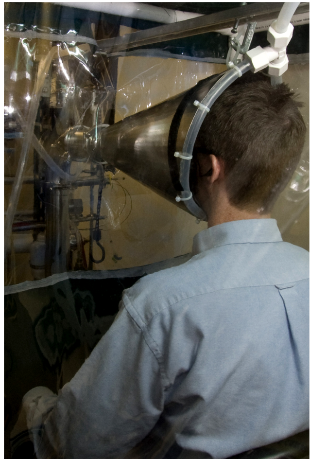
Figure 2. Exhaled breath collection system. Each volunteer sat as shown with face inside the inlet cone of the human exhaled breath air sampler inside a booth supplied with HEPA filtered, humidified air for 30 min while wearing an ear-loop surgical mask. Three times during the 30 min each subject was asked to cough 10 times. After investigators changed the collection media, the volunteer sat in the cone again, without wearing a surgical mask, for another 30 min with coughing as before.

RNA extraction in Trizol-chloroform, reverse transcription, and quantitative PCR were performed as previously described [1,32]. Quantitative PCR was performed using an Applied Biosystems Prism 7300 detection system (Foster City, CA) for coarse fraction samples or a LightCycler 480 (Roche, Indianapolis, IN) for the fine particle fraction. Duplicate samples were analyzed using influenza A and B primers described by van Elden et al. [33] A standard curve was constructed in each assay with cDNA extracted from a stock of influenza A (A/Puerto Rico/8/1934, Advanced Biotechnologies Incorporated, Columbia, MD) with a concentration of